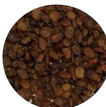
Sultana Grade 1