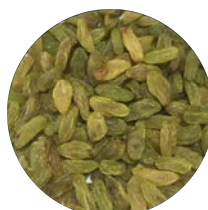
Golden Green Grade 1 / 2