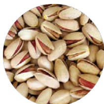
Badami (Long) Size: 24/26 26/28 28/30 30/32 32/36