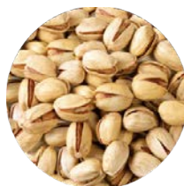
Fandoghi (Round) Size: 24/26 26/28 28/30 30/32 32/36