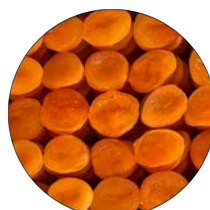
Apricots Size: Jumbo / 1 / 2 / 3 Moisture 25%