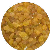
Golden Round Grade 1