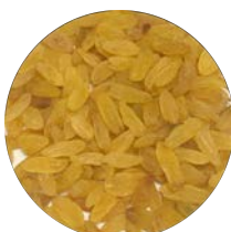
Golden Long Grade 1 / 2