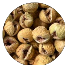
Dried Fig Types: Parak 101AAA 101AA 101A A B C