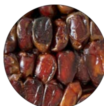
Sayer Natural / Pitted