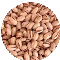
Mechanical Open (MO) Yield: 44% Available for all types