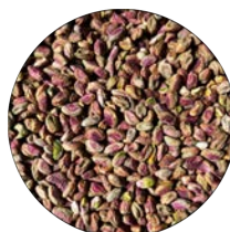
Kernel Machine/Hand Cracked