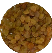
Golden Round Grade 2