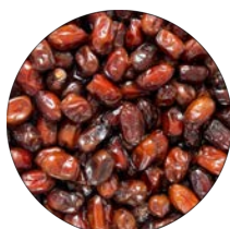
Kalooteh Grades: 1 / 2