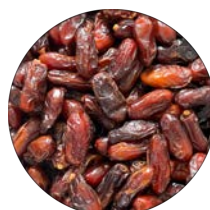
Kab Kab Natural