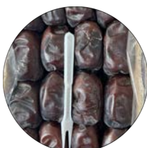
Mazafati Moisture: 13% ~ 25%