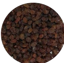
Sun-Dried Grades: 1 / 2