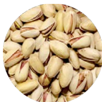
Akbari (AK) Size: 18/20 20/22 22/24 24/26 26/28