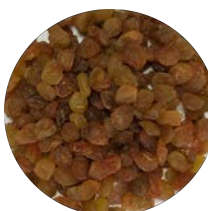
Malayeri Grade 1